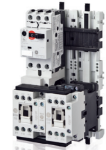
Efficor™ New contactors & starter combinations for demanding applications.