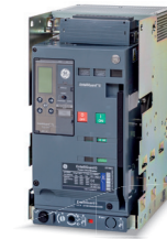
EntelliGuard™ T New compact frame further expanding the EntelliGuard G family.