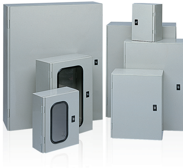
Aria Universal polyester cabinets.

Our latest developments are now available in EPLAN data portal.