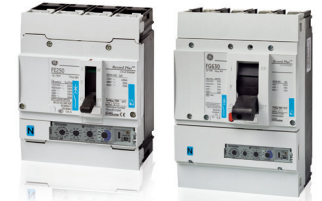
PremEon™ A new simplified and modern electronic trip unit.