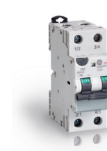
Unibis™ RCBO Saving up to 50% space in distribution boards. Residual current breaker with overcurrent protection.